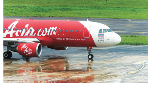
Pilot Gaurav Taneja had questioned AirAsia India's policies on sick leave, landing procedures, and handling of Covid-19

In a video posted in June that's been viewed more than 6 million times on YouTube, pilot Gaurav Taneja questioned AirAsia's policies on sick leave, landing procedures, and han-